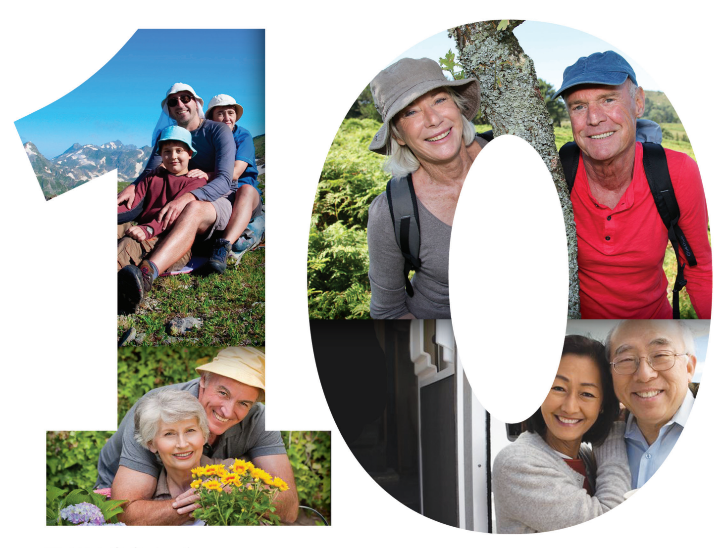
THINGS to know about Planning your RETIREMENT INCOME